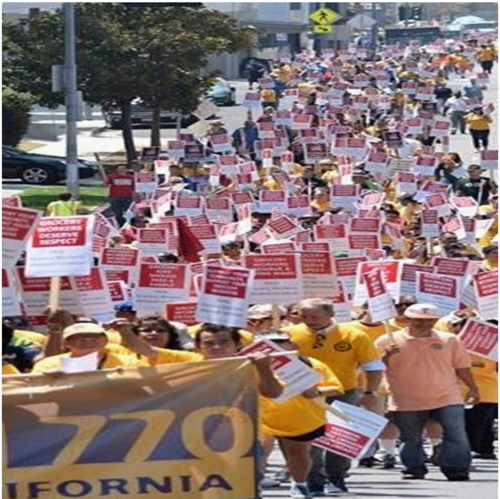
Successful August 2, 2016 labor-community demonstration for a new contract for grocery workers.

LABOR UNITED IN CLASS STRUGGLE / LABOR TODAY